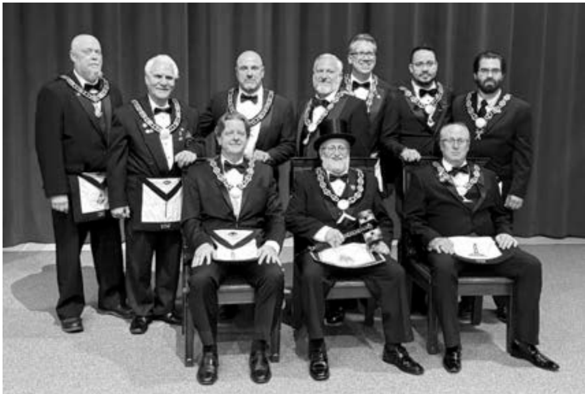
St Johns Lodge Number One Providence ~ Officers 2025-2026

Any Brother with special dietary needs beyond the listed menu, please mention it in your message.